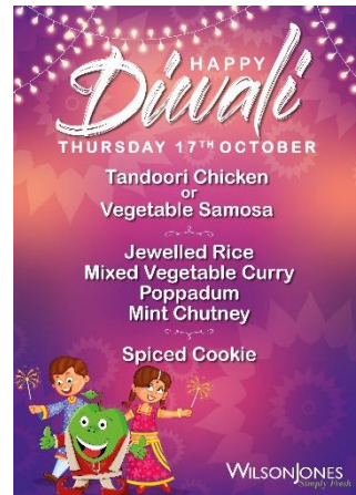
*Example Theme Day Menus

Our 'Simply Fresh' approach to your school meal service at Alexandra Primary School will comprise of the following: