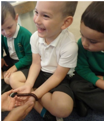
First hand experiences

Children will learn through play. The Early Years Practitioners will create enabling environments so that your child can be supported through positive relationships and challenged to learn as they play. Here are a few examples: