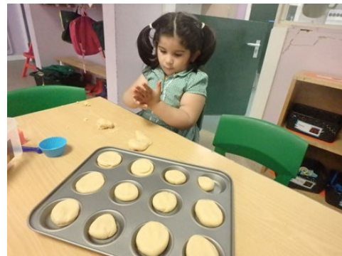
Baking – measuring, counting, following instructions