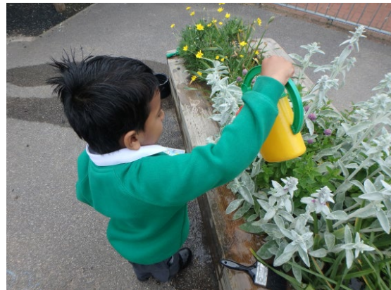
Understanding the world